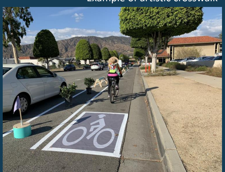
Example of separated bike lane