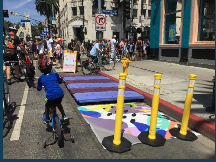
Example of curb extension