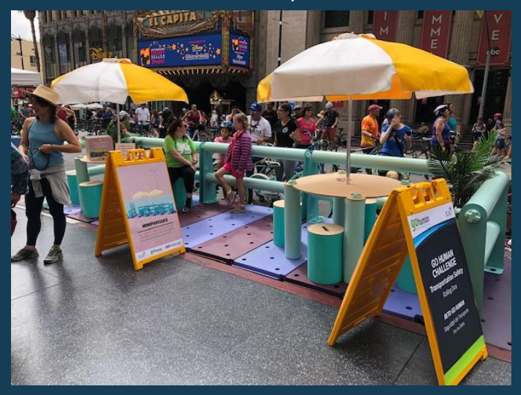
Example of parklet