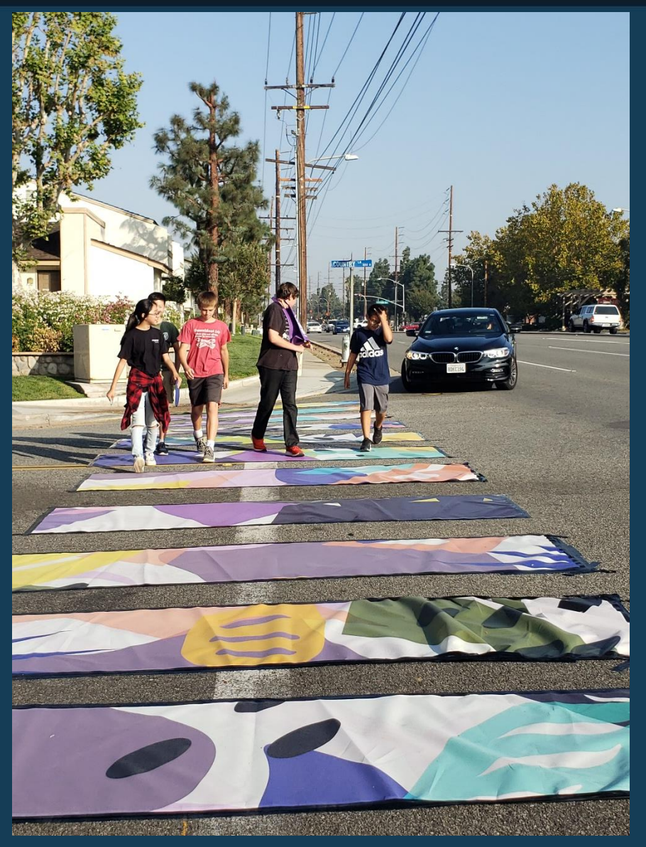
Example of artistic crosswalk