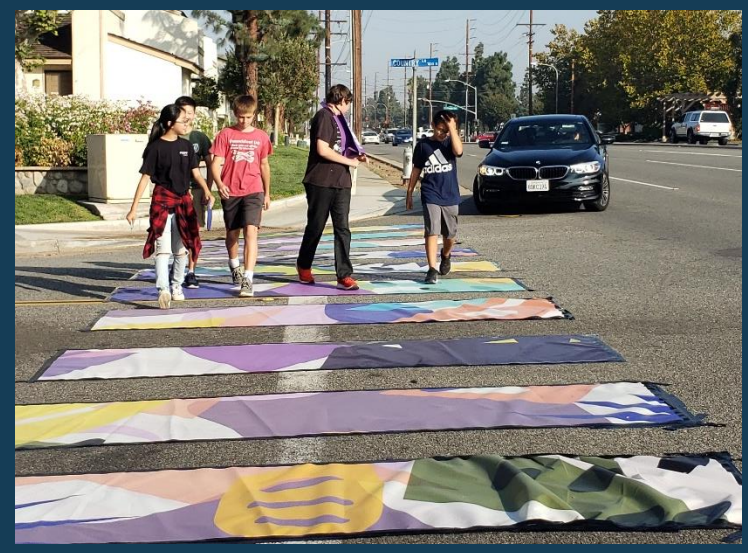
Example of artistic crosswalk