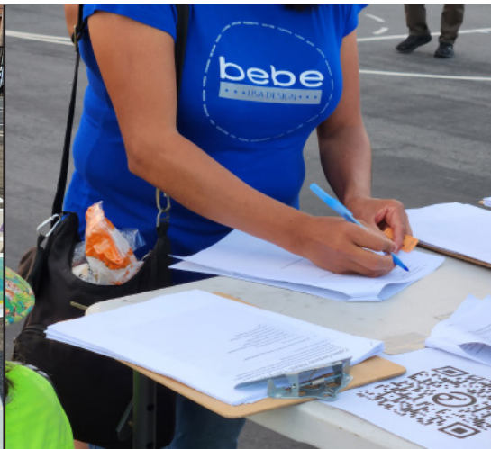
2 Community members stop by the table to take the survey. Many community members felt uncomfortable sharing too much info, but those that shared their thoughts had lots to say.