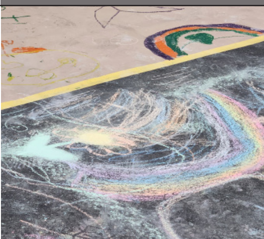
4 Kids used all manners of art supplies provided by organizers to create a design of their own for what they would like to see in their community.