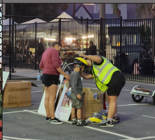
6 Young community member gets fitted for a bike helmet by one of the LCI's working with Santa Ana Active Streets.