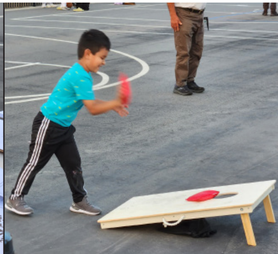
3 In addition to volleyball, there were a variety of different games that families could play together, which the kids enjoyed greatly.