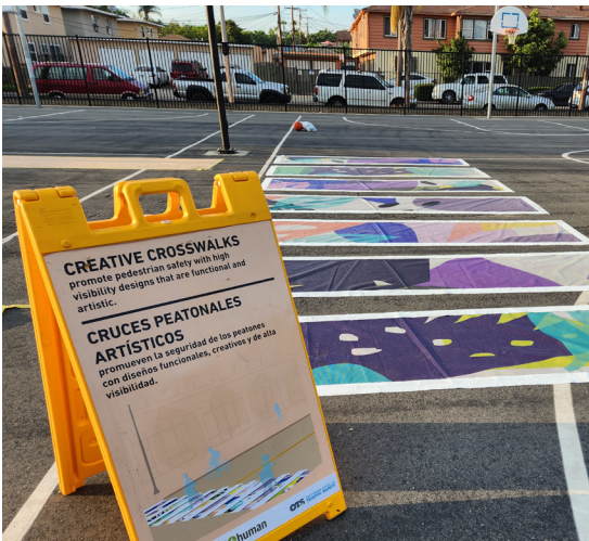
1 The artistic crosswalk was set out and served as one side of a display intended to allow kids to use paints, chalk, markers, and other implements to draw a design of their own for and artistic crosswalk