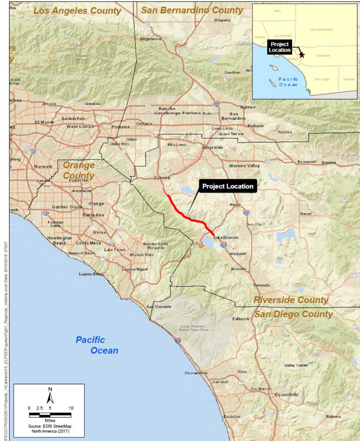
Figure 1 Project Vicinity Interstate 15 Express Lanes Project Southern Extension (I-15 ELPSE)